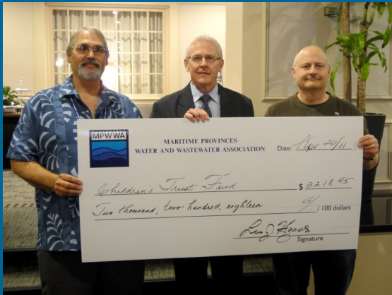
Cheque presentation to Children's Trust Fund Halifax, NS, 2011