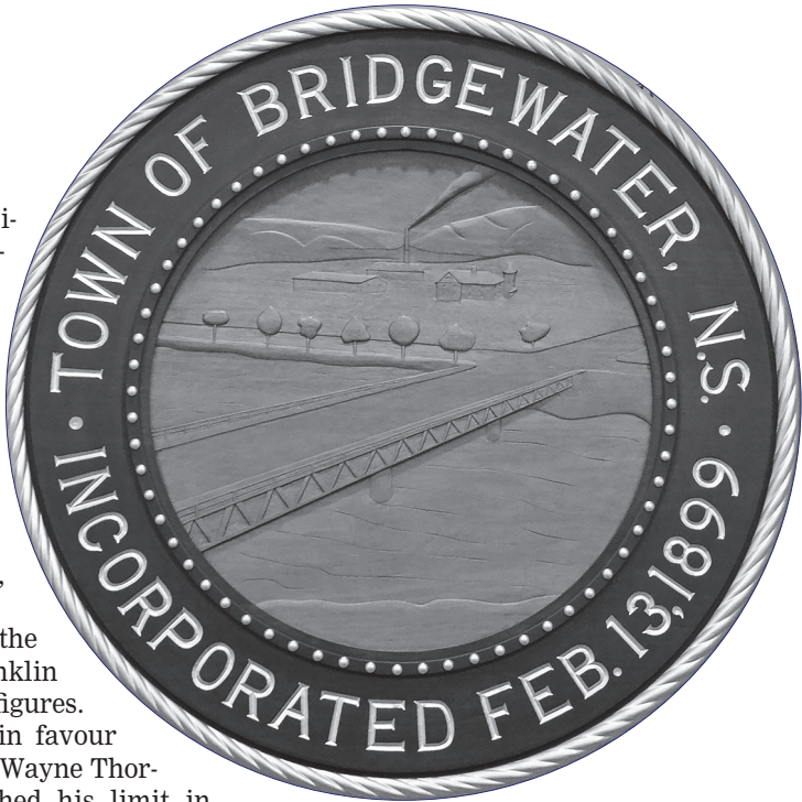
The Town of Bridgewater spiked residential tax rates for the second time in three years.

"We all recognize the challenge people face with soaring costs be it food, power or something else. The decisions we make today have an impact on all our tomorrows