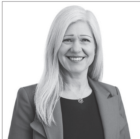
Moncton Mayor Dawn Arnold

The $36.3-million project the three levels of government are funding, in-