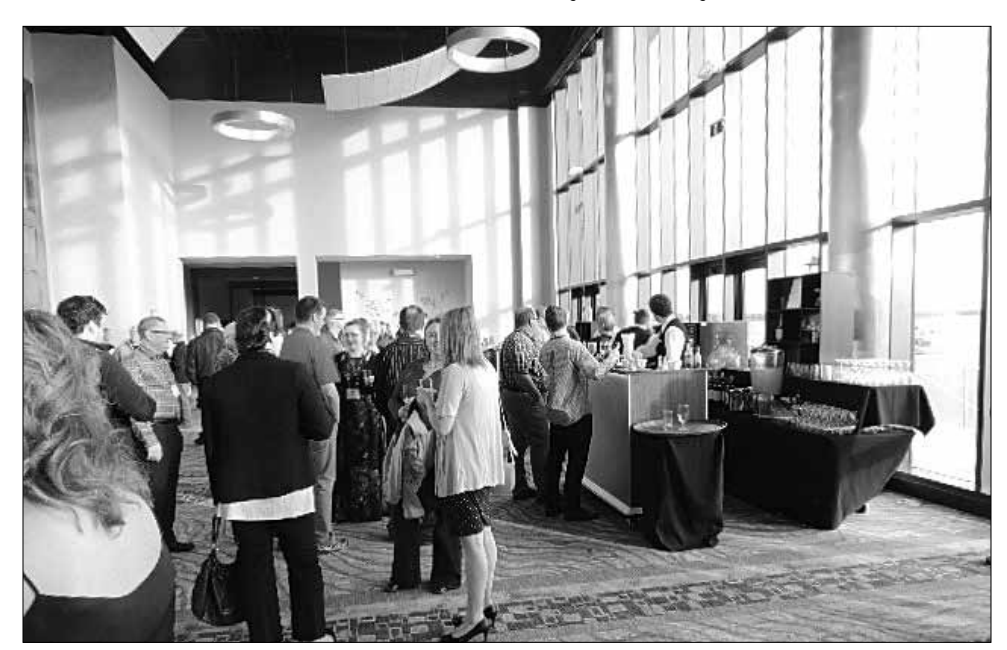
Given this year's theme, You Are Not Alone: Taking advantage of networking, social events were a crucial component, allowing delegates to mix and speak with new people.