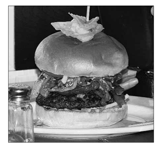
Good food is an essential part of any successful seminar.