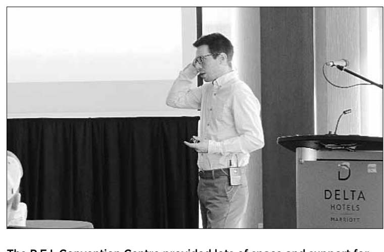
The P.E.I. Convention Centre provided lots of space and support for all the presentations.