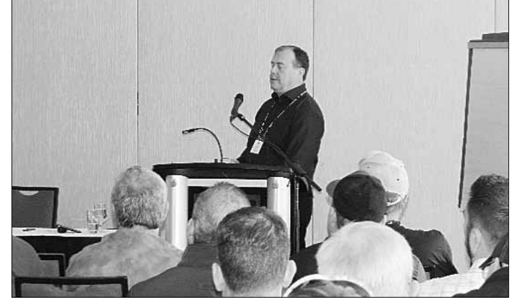
Delegates preparing for the Annual General Meeting and breakfast as the second day of the seminar gets underway.