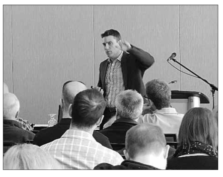
Topics covered by presentation speakers cover the whole spectrum, from solving common issues to new products and case studies.