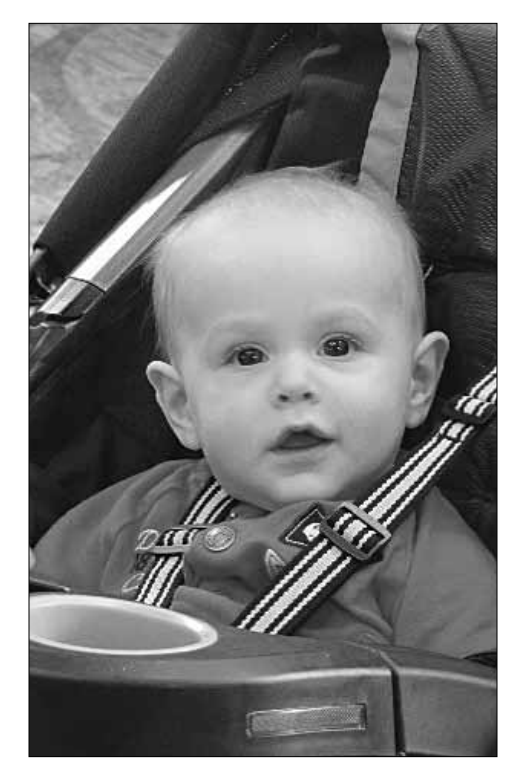
Easily the youngest attendee at this year's training seminar.

If you're wondering what you might have missed at this year's MPWWA training seminar and trade show, here's a little peek at some of the action.