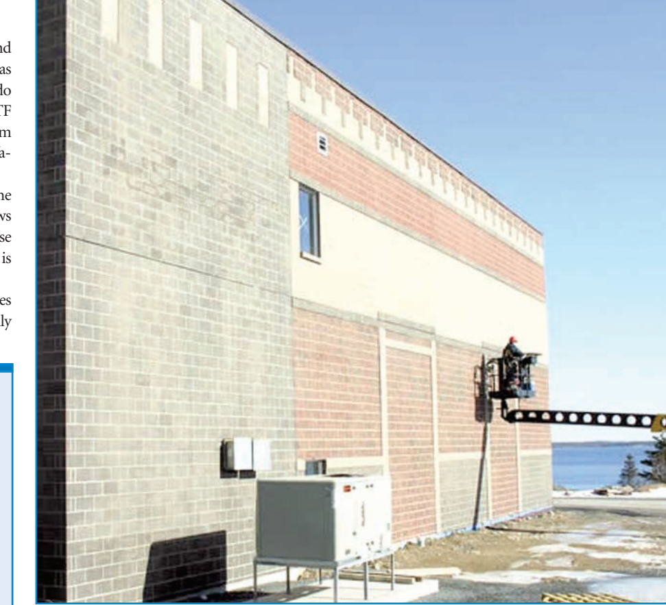
Herring Cover Wastewater Treatment Facility